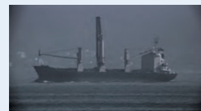
With Variable Contrast Control