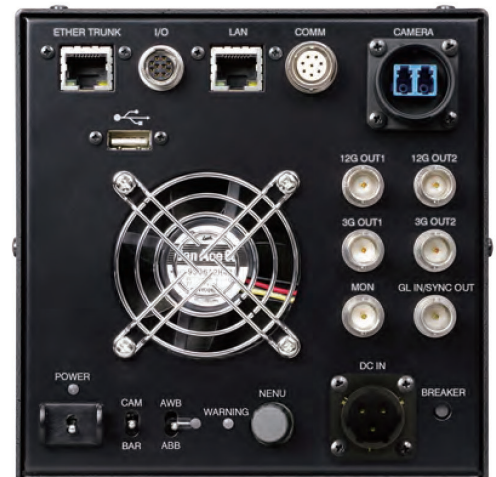
Rear Panel for CCU