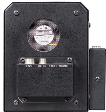
Rear Panel for Camera Head