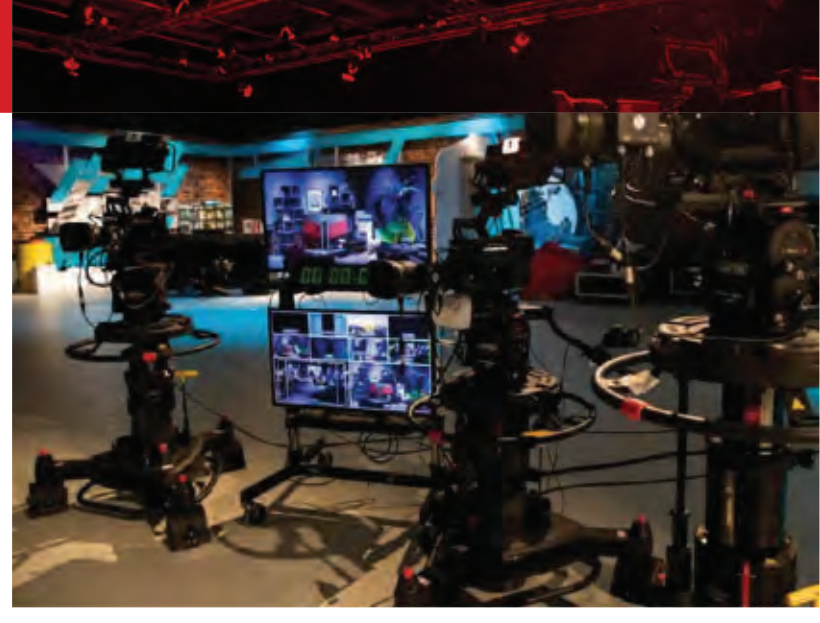
Cartoni pedestals installed at Freaks4U gaming studio in Berlin, Germany.

PERFECT FOR STUDIO & OB CARTONI PEDESTALS ARE LIGHTWEIGHT, STURDY, PRECISE, TORQUE-FREE AND PORTABLE.