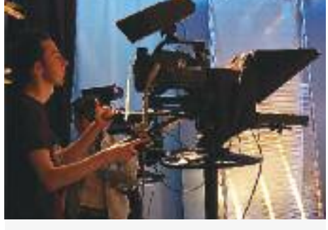
Above: Intuitive to use

Perfect Balance provides effortless fingertip control and reduces operator fatigue.