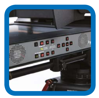
Simple controls and whisperquiet fans