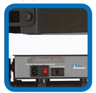
AC and DC power supply units