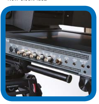
CVBS and HD-SDI video inputs